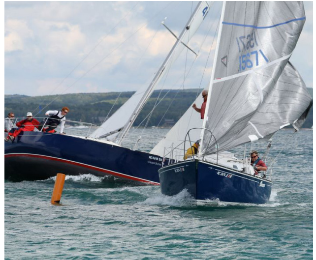
A Tense mark rounding during the 2011 Red Fox Regatta.