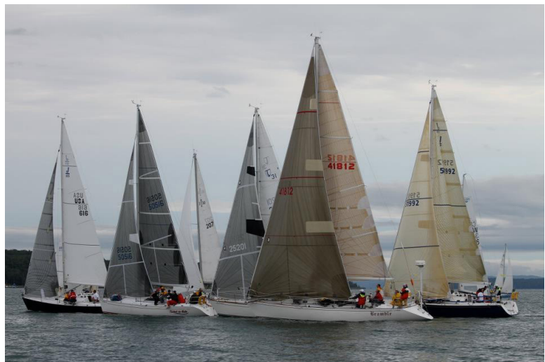
Racing toward the start of the 2011 Red Fox Regatta.